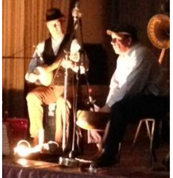
Thank you to the Kimberley and Beaches School Councils for providing the funds to pay for our Prologue performances,

Thanks to the Grade 6 Kimberley and Beaches students in the Prologue group for choosing this great performance!